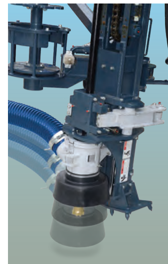
Reliable dust control system.